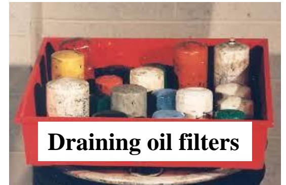
Draining oil filters

Non-terne used oil filters should be hot drained into a properly labeled container for at least 12 hours . Once the oil filter is properly drained, the filter can be disposed of as a solid waste along with the other regular trash in your solid waste dumpster. If you choose not to hot drain the filters, then the filters should be managed as used oil.