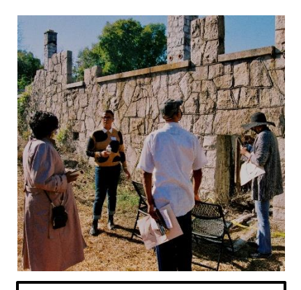
Participants in the November 2021 community engagement session discuss the history and importance of the Bruce Street School.

For more information, please visit arabiaalliance.org/brucestreet.